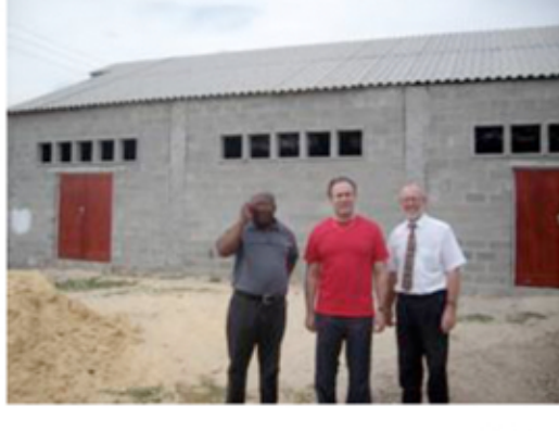
#18 Du Noon (Cape Town) Left

#18 DU NOON. CAPE TOWN, # 19 MUNSIEVILLE & # 20 KAGISO, KRUGERSDORP