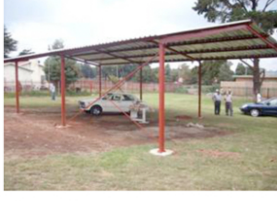
#20 Kagiso (See pg 5)